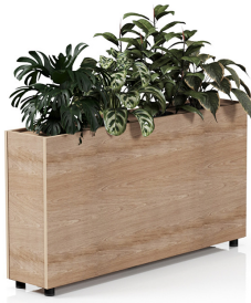
Model: PLN008 Planta 1500 Maxi W1500 x D300 x H800