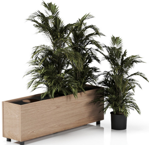
Model: PLN005 Planta 1370 Mini W1370 x D300 x H450