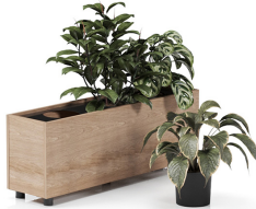
Model: PLN003 Planta 1200 Mini W1200 x D300 x H450