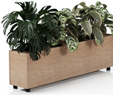
Model: PLN007 Planta 1500 Mini W1500 x D300 x H450