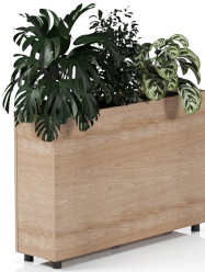
Model: PLN004 Planta 1200 Maxi W1200 x D300 x H800