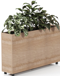
Model: PLN006 Planta 1370 Maxi W1370 x D300 x H800