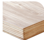
L-LTO Light Oak